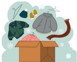
Kids Coat Drive