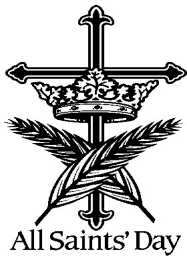
All Saints' Day

On All Saints' Sunday, we honor our loved ones who have passed. We need your assistance in compiling a current and accurate listing of these Saints who have gone to be with our Lord. If you would like to add a NEW NAME to our current listing, please fill out this form and mail to (90 South Main Street, Cranbury, NJ 08512 or email, office@stdavidscranbury.com ) the Parish Administrator in the Church Office by October 28.